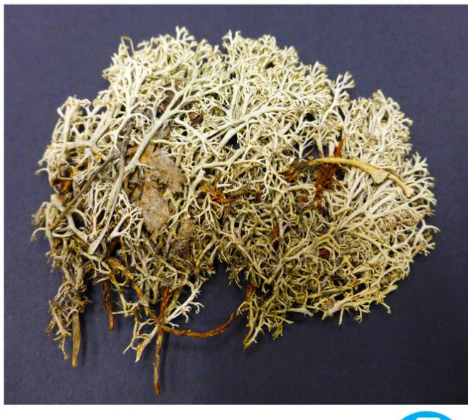
Greygreen Reindeer Lichen Cladonia rangiferina